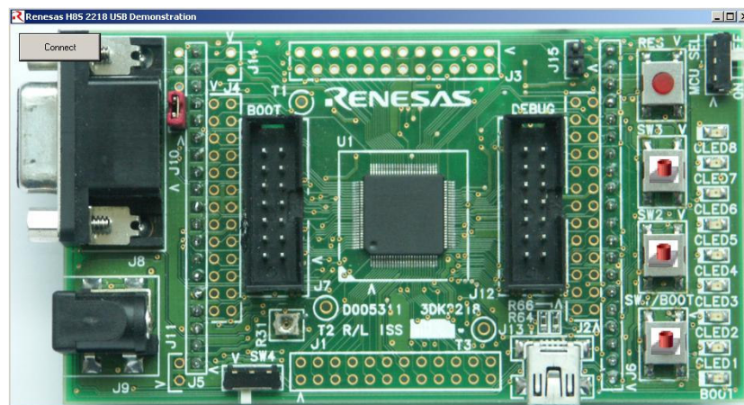
Figure 1: HID application GUI

Figure 1 shows a screen shot of the PC application which can be used to control the H8S/2218.