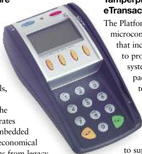
K71x photo courtesy of Keycorp.

The Renesas ePOS Reference Platform is a robust e-transaction terminal architecture that can be customized to work across a diverse range of industry-compliant payment products, including classic payment (EFTPOS), terminals, PC-connected payment terminals, PIN pads and embedded readers. The open-standard architecture incorporates world-class chip technology with embedded security acceleration. Designed for economical implementations and easy transitions from legacy applications and hardware, the Platform delivers high reliability, top-notch security, and EMV and Visa Smart POS compliance at a compelling and attractive price point for terminal manufacturers. The intensive cryptography functions of the CPU are powered by a pre-certified, low-power chipset so that POS manufacturers can easily deliver full-featured competitive systems with minimal integration or certification efforts.